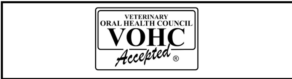
Figure 2: http://www.vohc.org/use_of_seal.htm

A good thing to look for on any dental-related product is the VOHC logo: