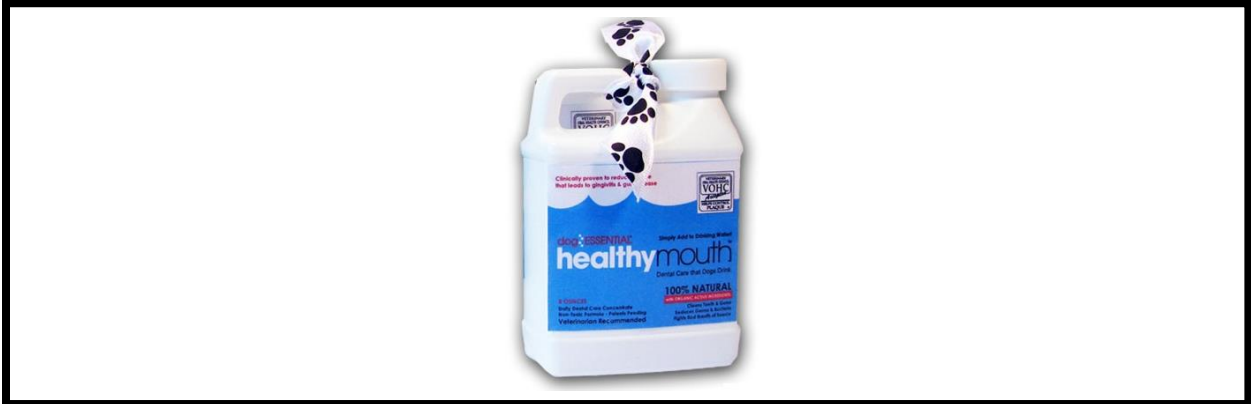
Figure 4: https://www.healthymouth.com/dog_ESSENTIAL_Value_Jug_p/d008.htm

Water additives are a last resort. They do not work as well as the above mentioned home dental care options as they do not provide any mechanical action, but they can provide some benefit. We recommend the following water additive: