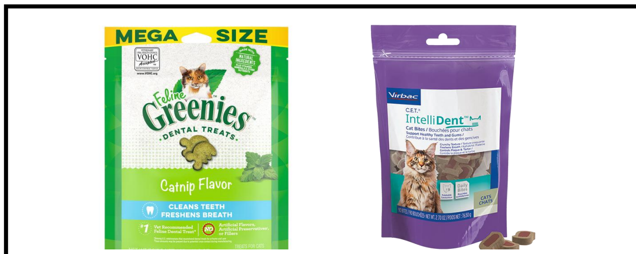
Figure 3: https://www.greenies.com/collections/cat-dental-treats , https://us.virbac.com/products/dental/cet-intelligent-cat-bites#image

Here are a couple of the dental treats we recommend: